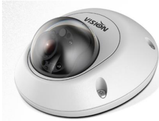
Built in Mic: Interior camera