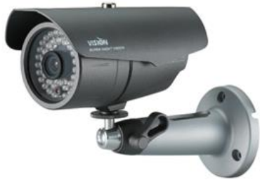
Super-low light sensitivity version

Compact slim design with quick & easy installation