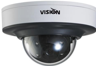
Super-low light sensitivity version

Improved High Power LED's Compact slim design with quick & easy installation